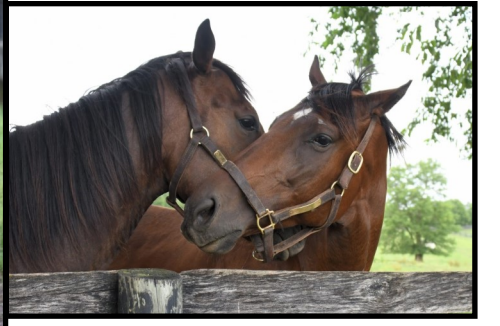
DIVERSIFY and PERSIE failed their social distancing class.