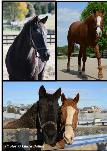
Dinard (l) and Archie's Echo