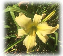
The award-winning lily named Old Friends.