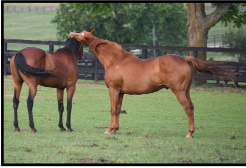
PORFIDO & DAYTONA. We're not sure. Maybe horse yoga?