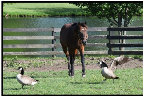
SMOOTH AIR invited the neighborhood geese over for a paddock party.

GAME ON DUDE got bored, tried a new tail stylist. It didn't go so well.