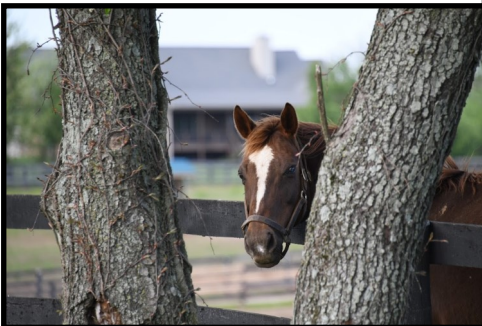
SARATOGA EPISODE played hide-n-seek. The farm staff indulged him. His paddock mates? Not so much.