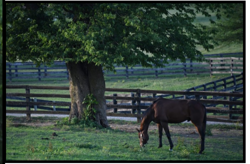
DIVERSIFY spent quality time with his tree.