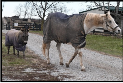
Alphabet Soup & Gorgeous George