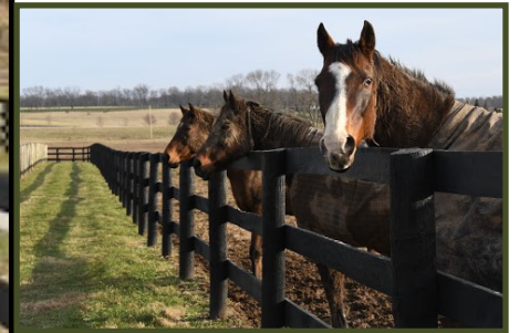
Summer Attraction, Slamming & Disturbingthepeace