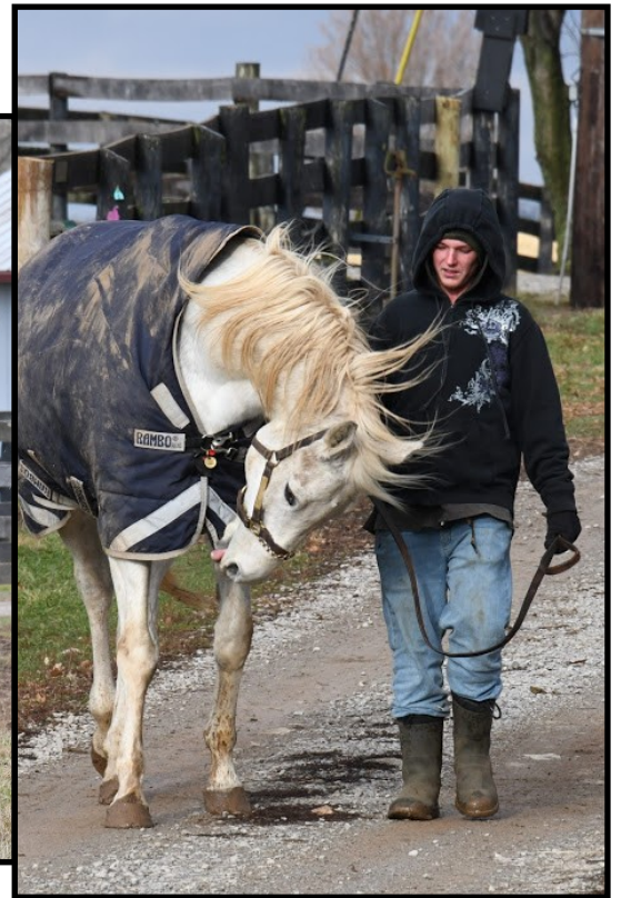
Silver Charm Heading in for Dinner