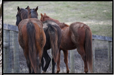
Does this fence make our butts look big?