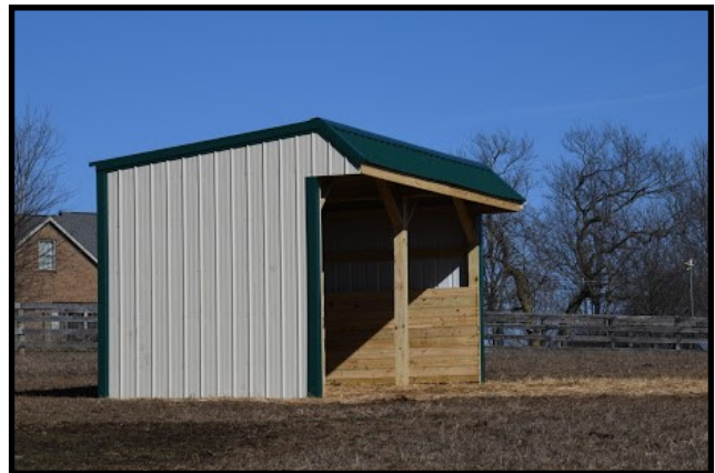
Run-In Shed sponsored by California Chrome's Legacy of Love