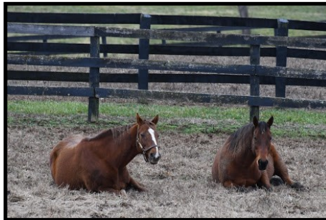
Nap Time for Rapid Redux & Amazombie