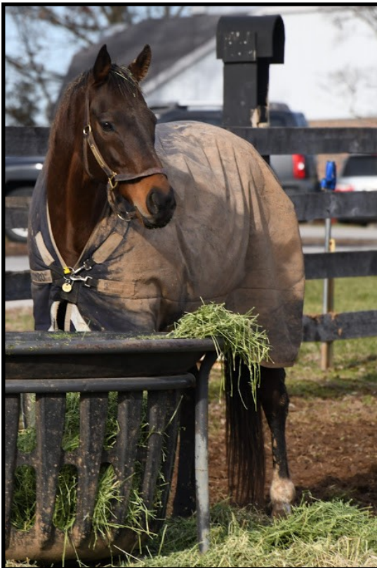
Game On Dude