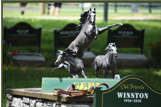
Memorial Day 2019