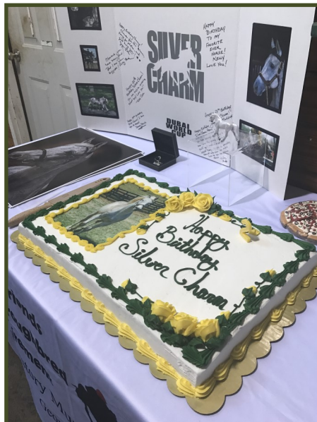
Silver Charm's 25th Birthday Cake