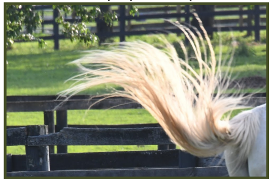
The tail of Alphabet Soup