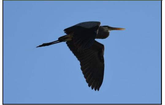
Our resident lonely Blue Heron