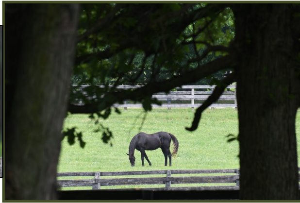
You and I