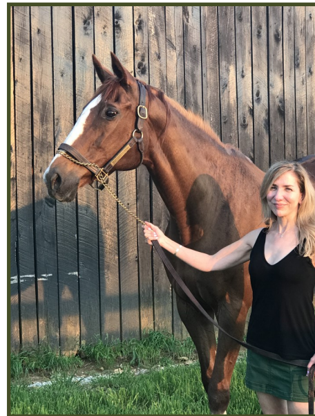
. . .and author Laura Hillenbrand

Saudi Poetry ended her racing career with five wins out of her 15 starts and earnings of $596,972. As a broodmare, she continued to attract regal attention. In 2003, in foal to Silver Deputy, Saudi Poetry was a $2.2 million broodmare acquisition. Two years later, in foal to Unbridled's Song, the mare again sold, this time for $2 million.