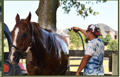
Bath Time with Shadow Caster