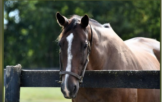
Silver Charm's Daughter Classy Charm