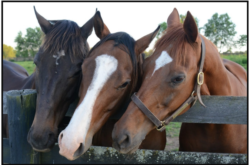
Old Friends Stick Together: Fabulous Strike, Sokitumi Samurai & Awesome Gem