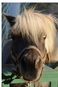
Little Silver Charm

People are always asking me: What are you? Are you a miniature horse? A Shetland pony? A combination of both? Or something else?