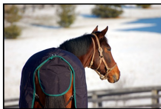
Hidden Lake warm in her blanket