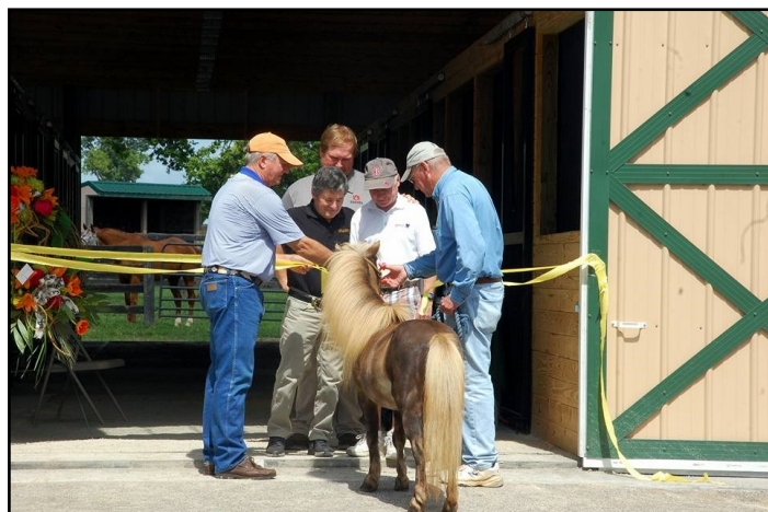
John Hettinger Memorial Barn Ribbon-Cutting