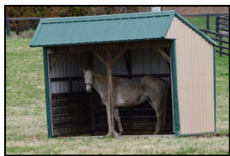
Silver Charm stays out of the rain