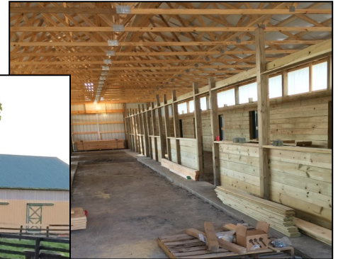
Old Friends Photos

Two of the eleven stalls in this new barn are “Penthouse Suite” stalls that are 1.5 times the length of the other nine stalls. These two larger stalls are ideal for horses who may have to spend a more extended time inside and for horses who are temporarily facing challenges with mobility. The larger stalls are easier and safer for the horses to move around in and safer for the veterinarians and staff who may be helping them with their mobility challenges.