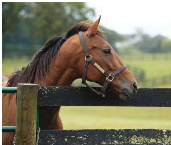
BARBARA D. LIVINGSTON

Today, Kharafa and King Kreesa share the same paddock with a few other geldings, but those two are inseparable paddock pals. You can always find them side-by-side all day long.