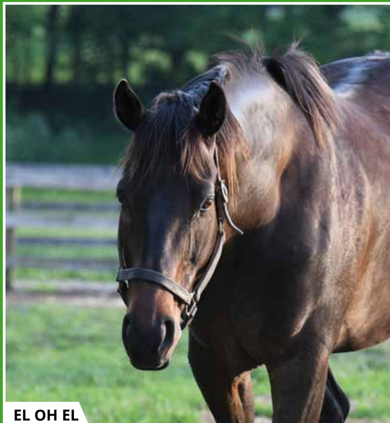
EL OH EL