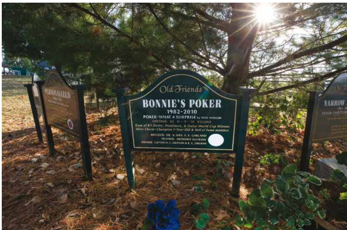
Bonnie's Poker lived at Old Friends from November of 2004 until her death in August of 2010.