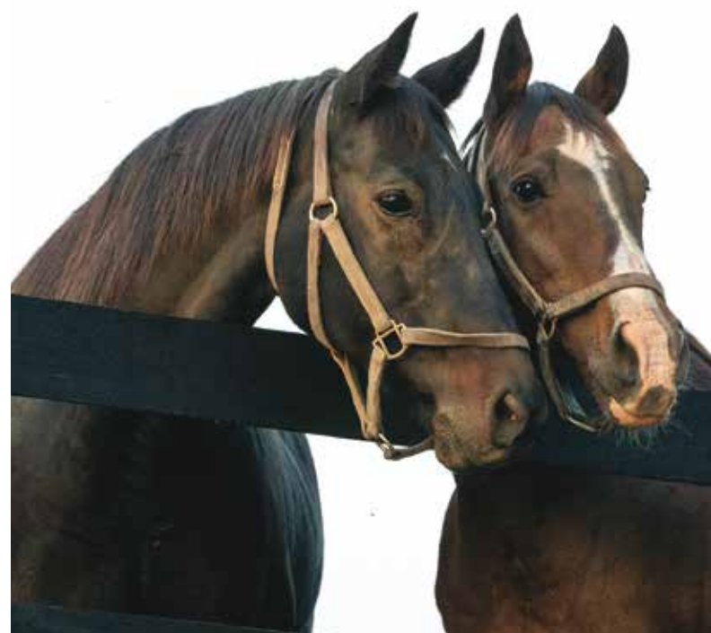
Top: A herd of geldings kick up dust as they run through a field. Right: Cajun Beat (left) and Padua's Pride. Above: Alphabet Soup and Gorgeous George.