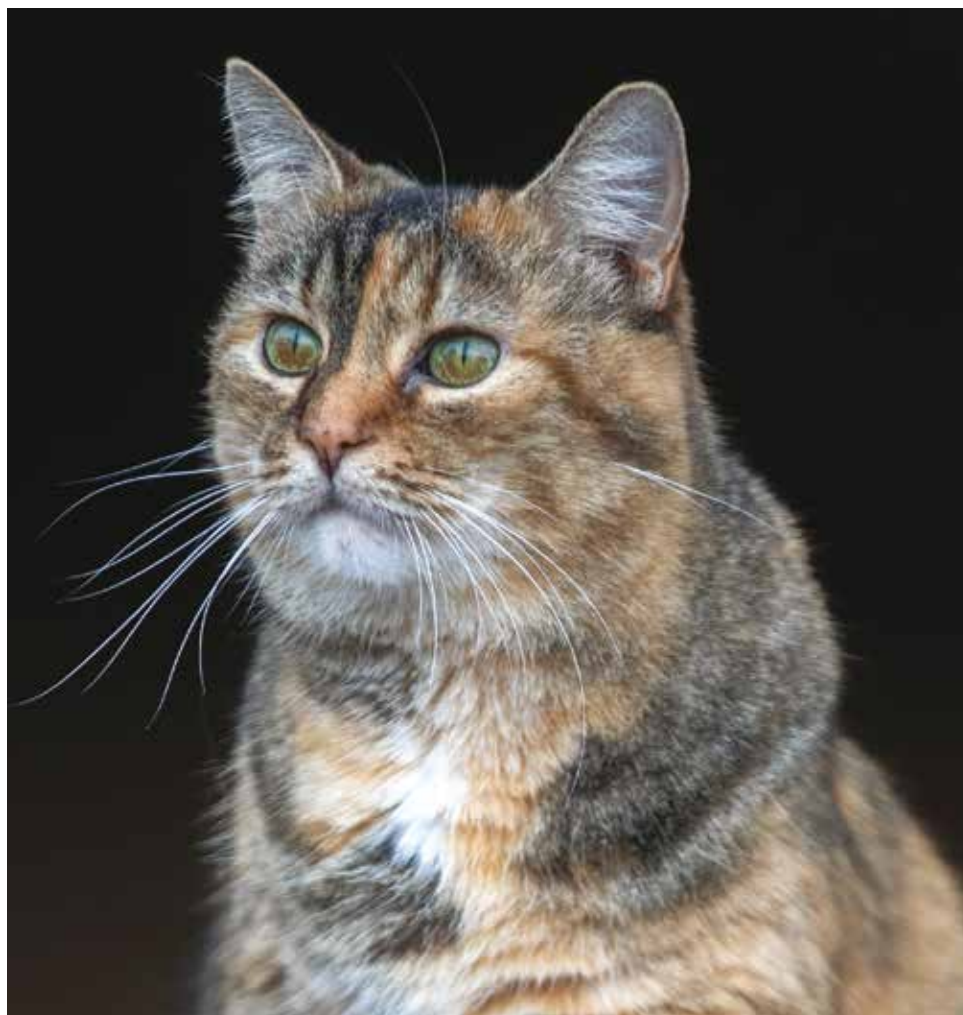
BARBARA D. LIVINGSTON

Do you know that some people don't believe in feeding barn cats? They think starving a cat will make her a better mouser. This is nonsense. I like a nice juicy mouse as much as the next cat, but I believe in a well-rounded diet that includes both dry and wet cat food, plus the occasional treat. Nutrition is an important part of barn cat fitness. So is exercise. It may seem that I don't move around very much, but when I think no one is looking, I like to run around madly in circles. I try to do it at least once a day. It's a cat thing.