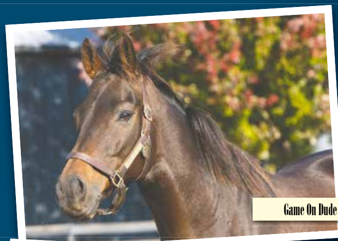
Game On Dude