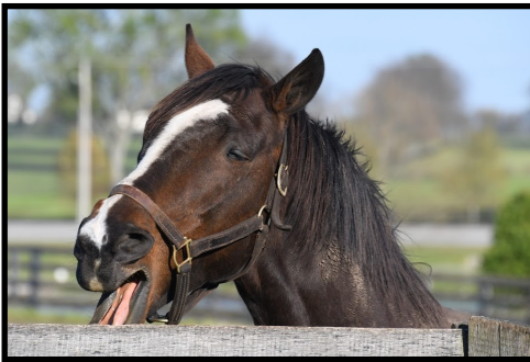
New guy POLLARD'S VISION got bored waiting for the tourists he was promised.