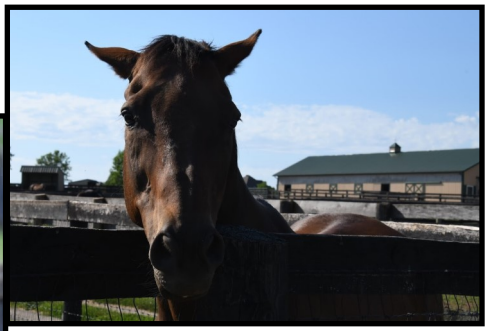
Whatever BOULE d'OR was working on didn't make him happy.