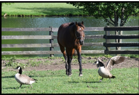
SMOOTH AIR invited the neighborhood geese over for a paddock party.