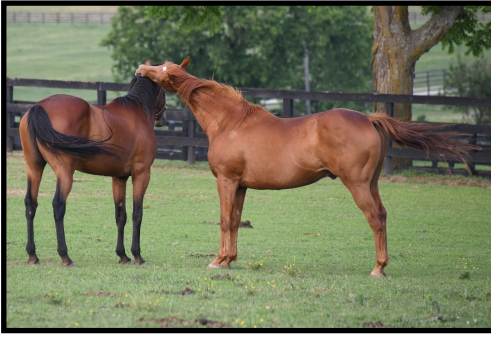
PORFIDO & DAYTONA. We're not sure. Maybe horse yoga?