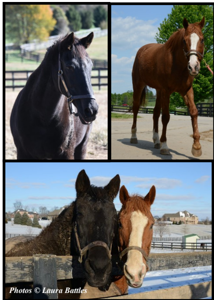
Dinard (l) and Archie's Echo