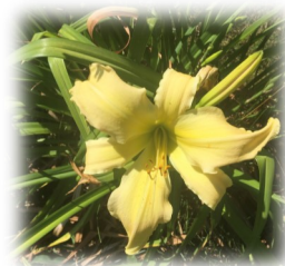
The award-winning lily named Old Friends.