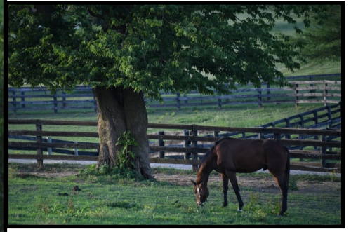
DIVERSIFY spent quality time with his tree.