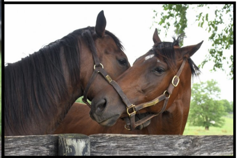
DIVERSIFY and PERSIE failed their social distancing class.