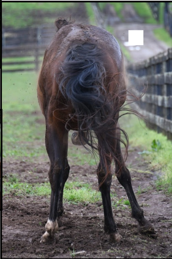
SARATOGA EPISODE played hide-n-seek. The farm staff indulged him. His paddock mates? Not so much.