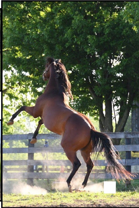
LITTLE MIKE got bored with horizontal and decided to give vertical a try.